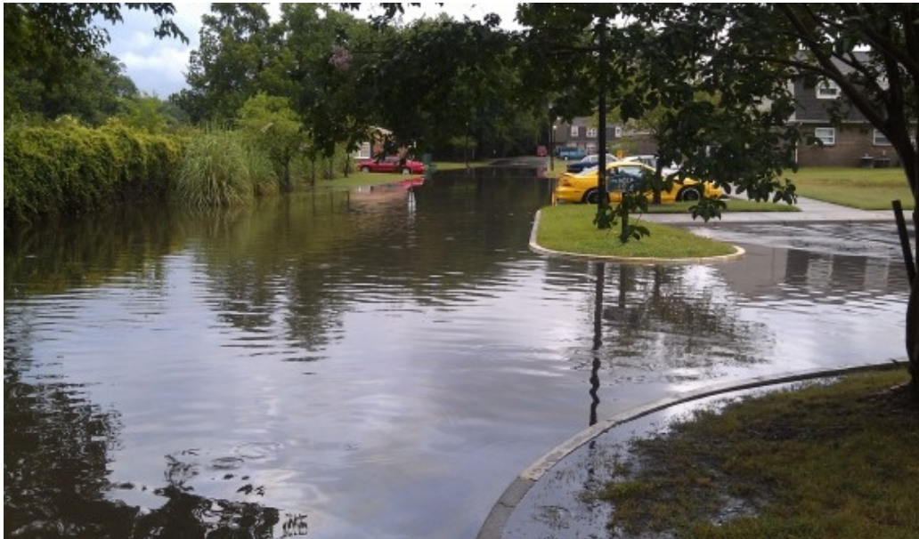
Nuisance flooding in Norfolk on July 11, 2012